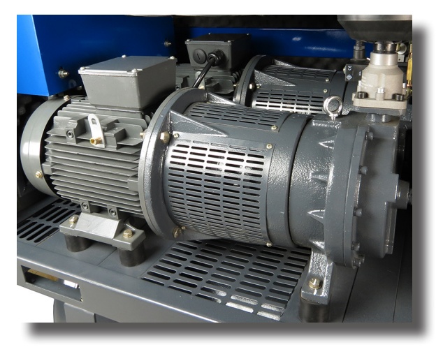
Twin pump features only applies to SX15 models

The Scroll-X 15 kW has exceptional power saving ability with its twin pump rotational system. The 15 kW Scroll-X has 2 x 7.5 kW pumps set in a master/slave operation.