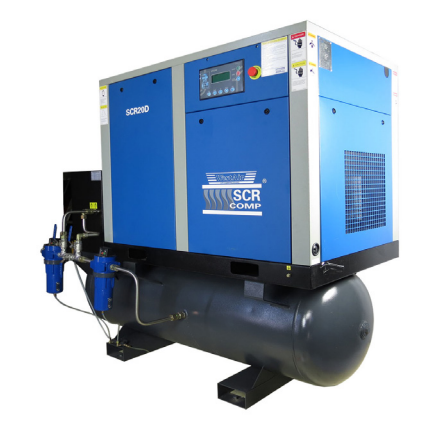
*Tank has been reversed to show filters, bypass and condensate manifold.

Waste condensate is neatly piped into to a manifold which comes out of one exit point to be fitted to either an oil water separator or waste oil container.